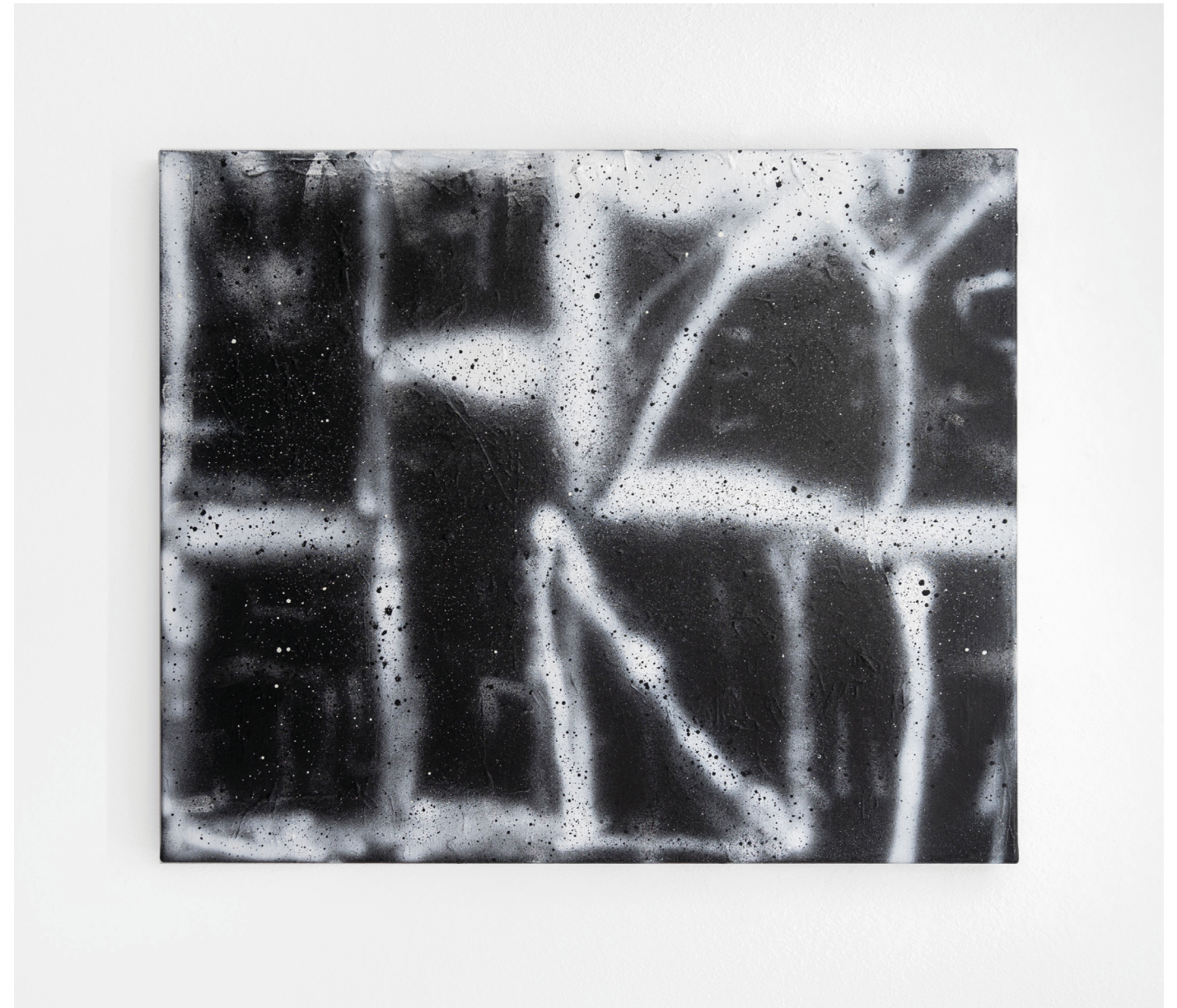
Richie Culver Less is more, 2022 Acrylic and lacquer on canvas 200 x 180 cm 78 3/4 x 70 7/8 in