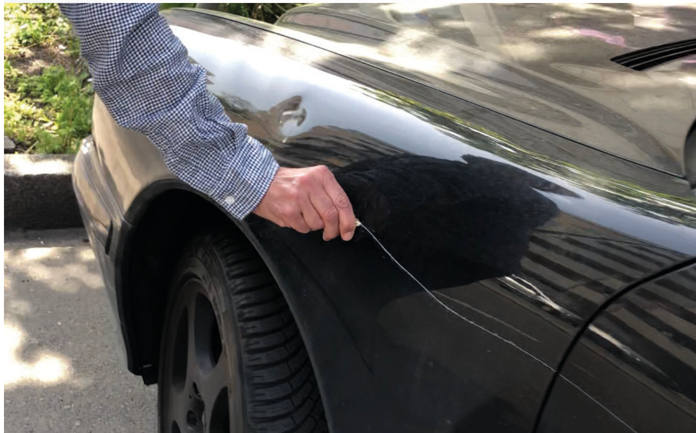
PHILIP NEWCOMBE Untitled, 2020 - ongoing Uncut Key / a line scratched across a surface

Dealer, 2022 WDB2102061X092052 / E220 CDI / DAIMLERCHRYSLER (D) / B LJ 2238 / EURO 3 / DIESEL / SCHWARZ / 205 65R15 94H / 14.02.2003 / 0710 441 / 0144