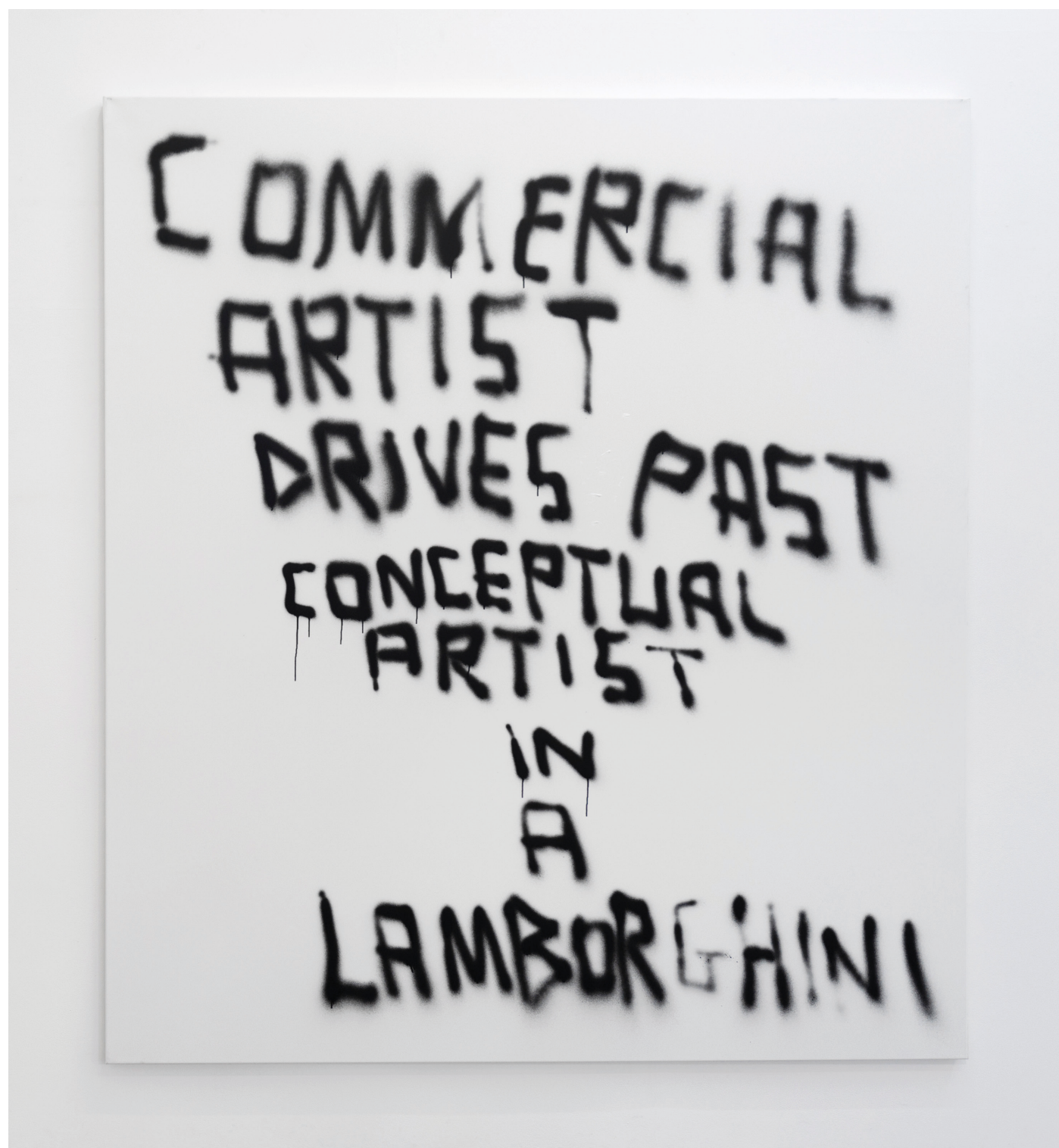
Richie Culver Lamborghini, 2022 Acrylic and lacquer on canvas 200 x 180 cm 78 3/4 x 70 7/8 in