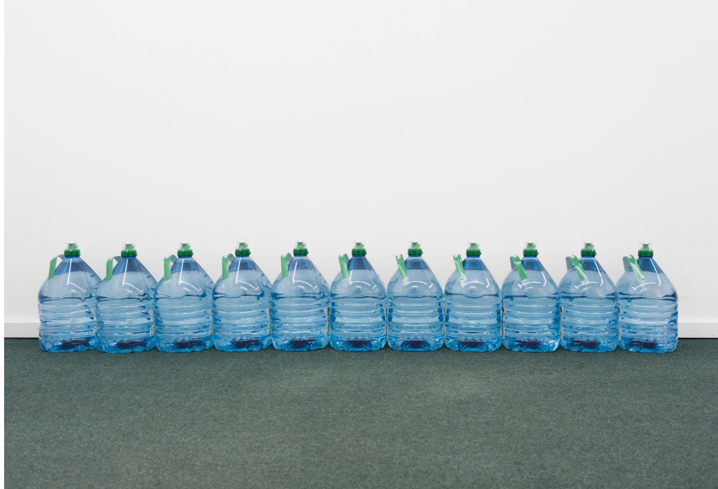
Philip Newcombe Social Water, 2022

Water from 8-litre bottles of water exchanged between each other. Dimensions, volume and amounts of contained water are variable. Start with no less than three 8-litre bottles and increase this number incrementally throughout time to the maximum amount of forever. Expand this activity outdoors if necessary; go into the street, into a town, a city, a country, a continent. The amount of water and how and where to place the bottles is left to the discretion of the person installing the work. However, all bottles must be placed next to a wall, never free standing in a space. At the end of the exhibition all of the water should be poured down the closest gutter in the street for the rats. The bottles should be disposed of responsibly.