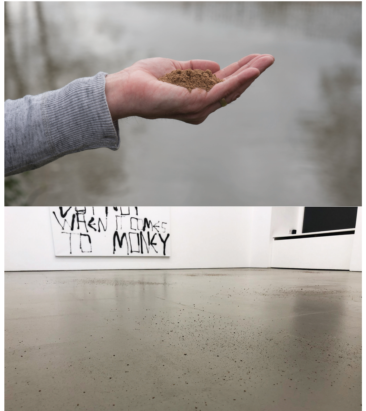
Philip Newcombe Driftwood, 2016 - ongoing

This text is written from the perspective of someone looking out of the window of a speeding train, watching cows drinking water from a trough, a man urinating against the wheel of a car and a punctured inflatable swimming pool.