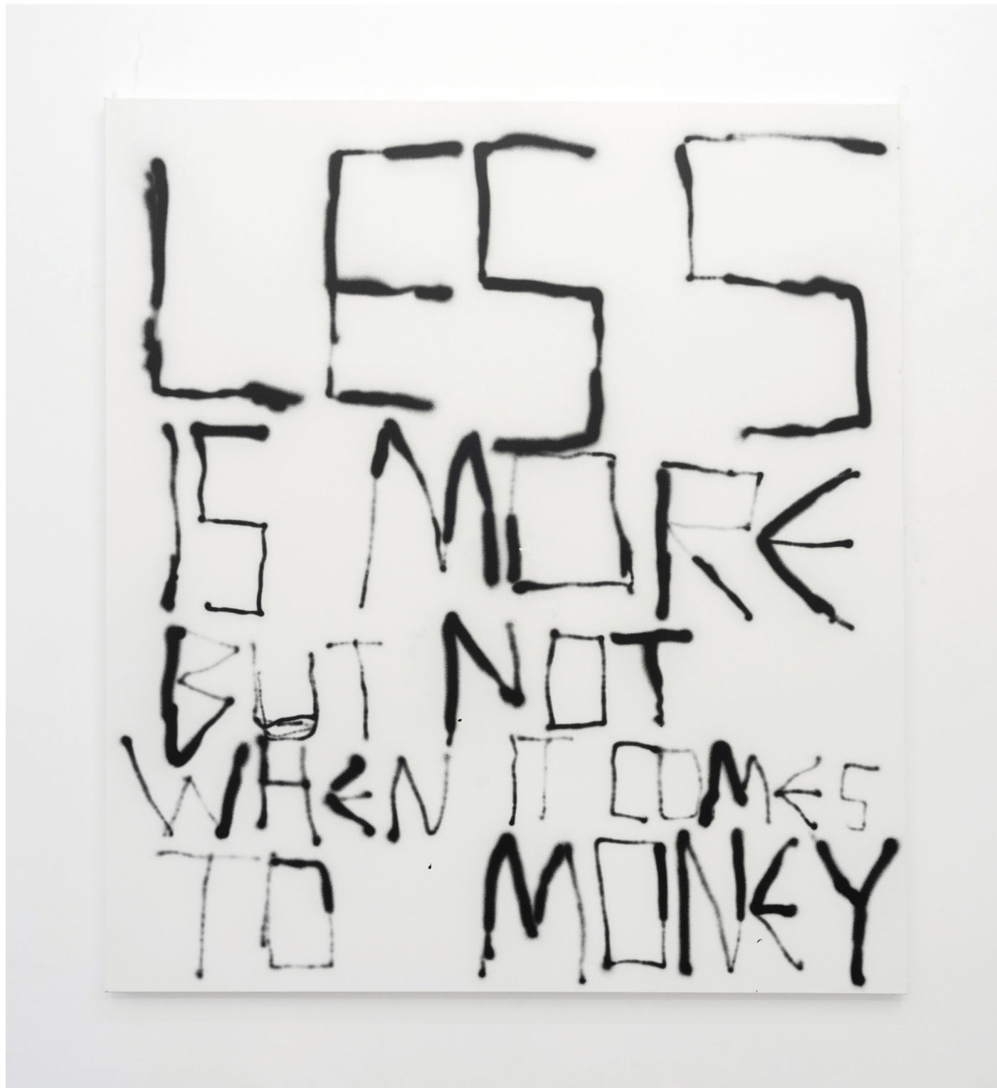
Richie Culver Less is more, 2022 Acrylic and lacquer on canvas 200 x 180 cm 78 3/4 x 70 7/8 in