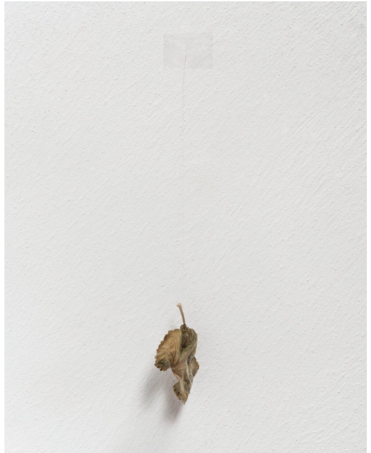
Philip Newcombe Stolen at Dusk, 2016 Tape, hair from my head, a leaf never to have fallen to the ground Approx 23 cm

Dealer, 2022 WDB2102061X092052 / E220 CDI / DAIMLERCHRYSLER (D) / B LJ 2238 / EURO 3 / DIESEL / SCHWARZ / 205 65R15 94H / 14.02.2003 / 0710 441 / 0144