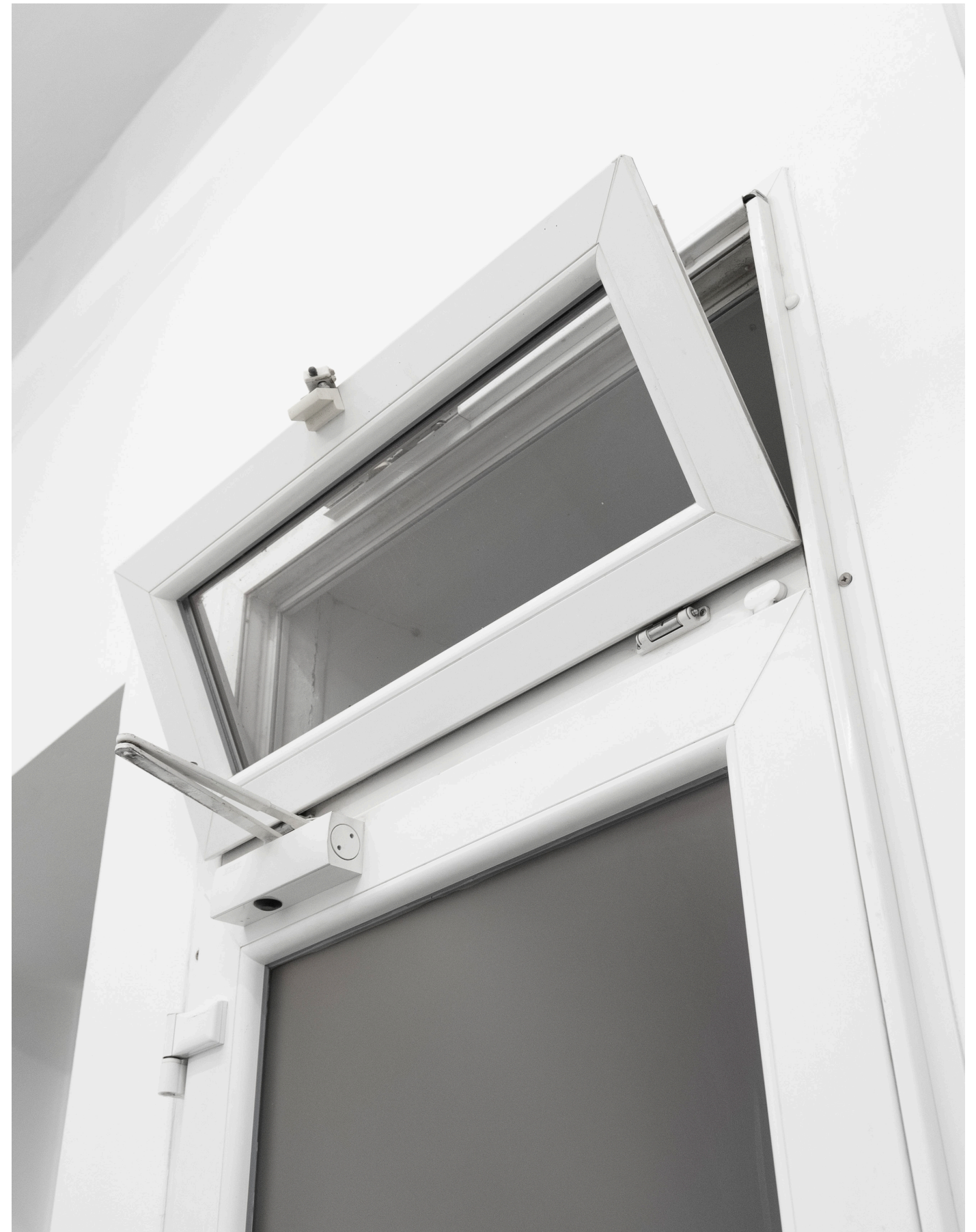
Some Time Waiting, 2025 Porcelain place for an eventual bird, a window left slightly open, 90mm x 4.5mm Ø