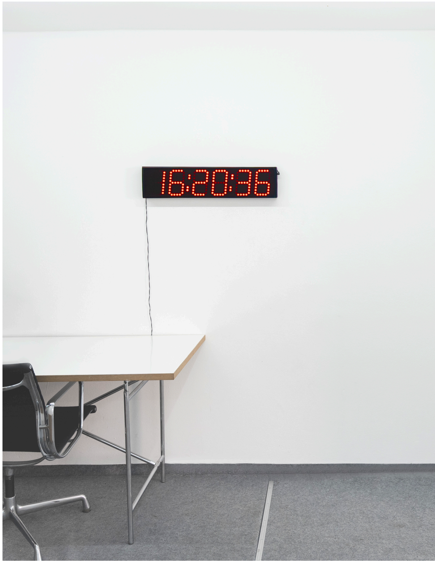
Rebecca Lights A Cigarette, 2025 Digital clock set to five seconds earlier when Rebecca lit a cigarette