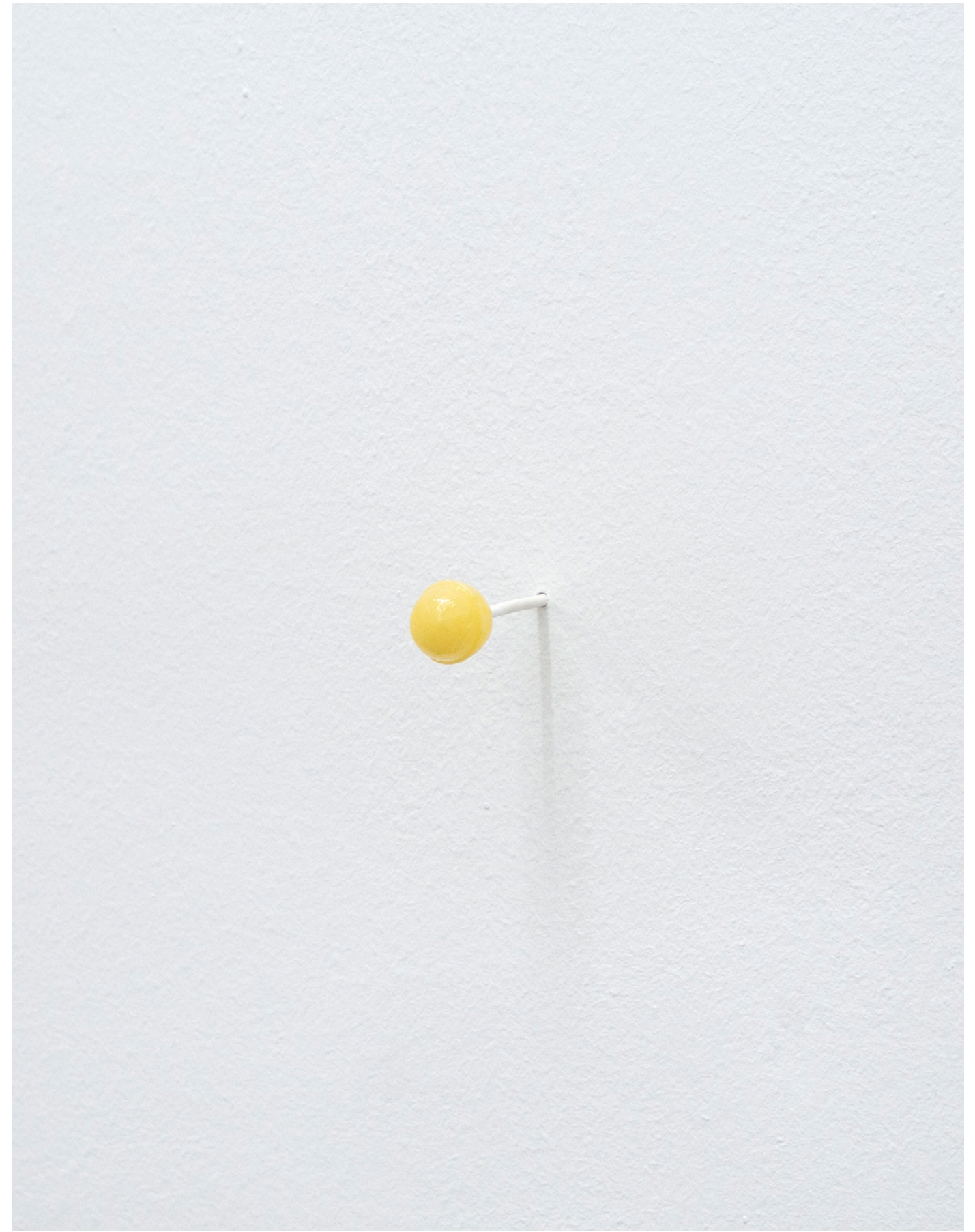
Pop!, 2007 Lollipop / Liquid LSD