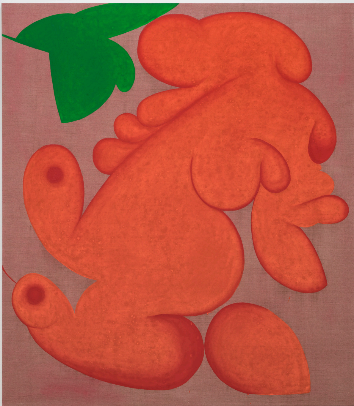
NoT136 / 2017 / oil on linen / 195 x 170 cm