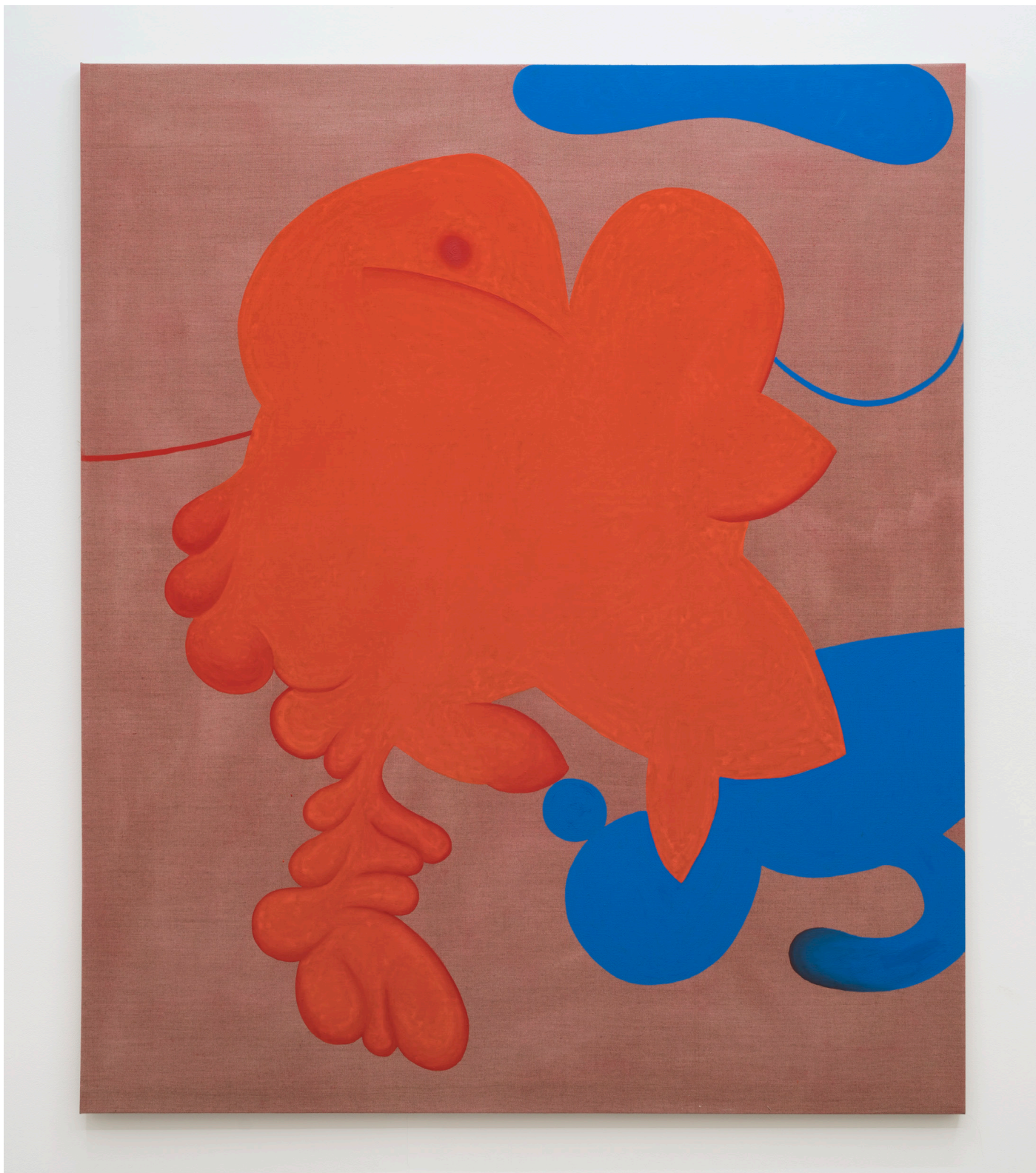
NoT139 / 2017 / oil on linen / 195 x 165 cm