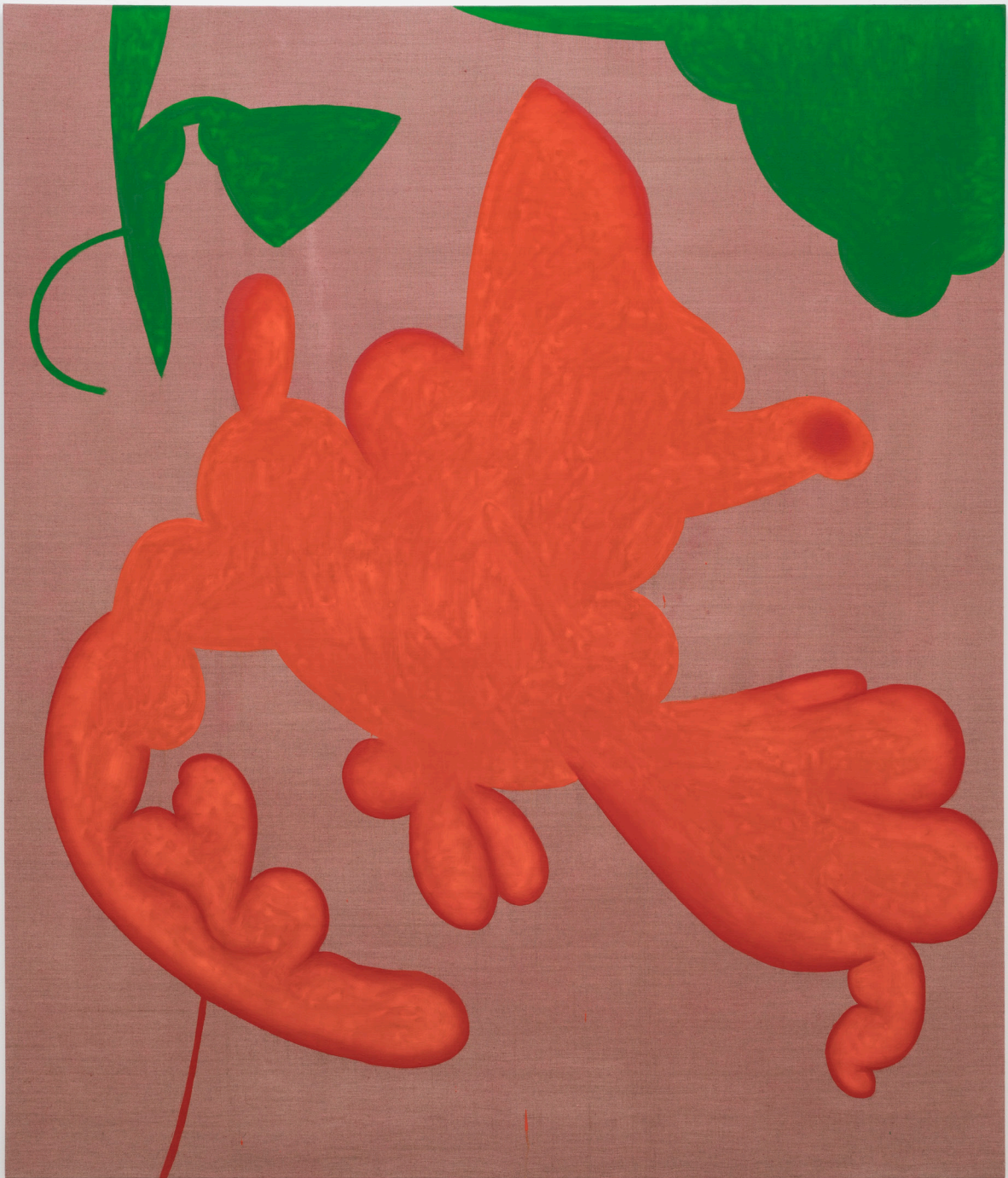
NoT137 / 2017 / oil on linen / 195 x 165 cm