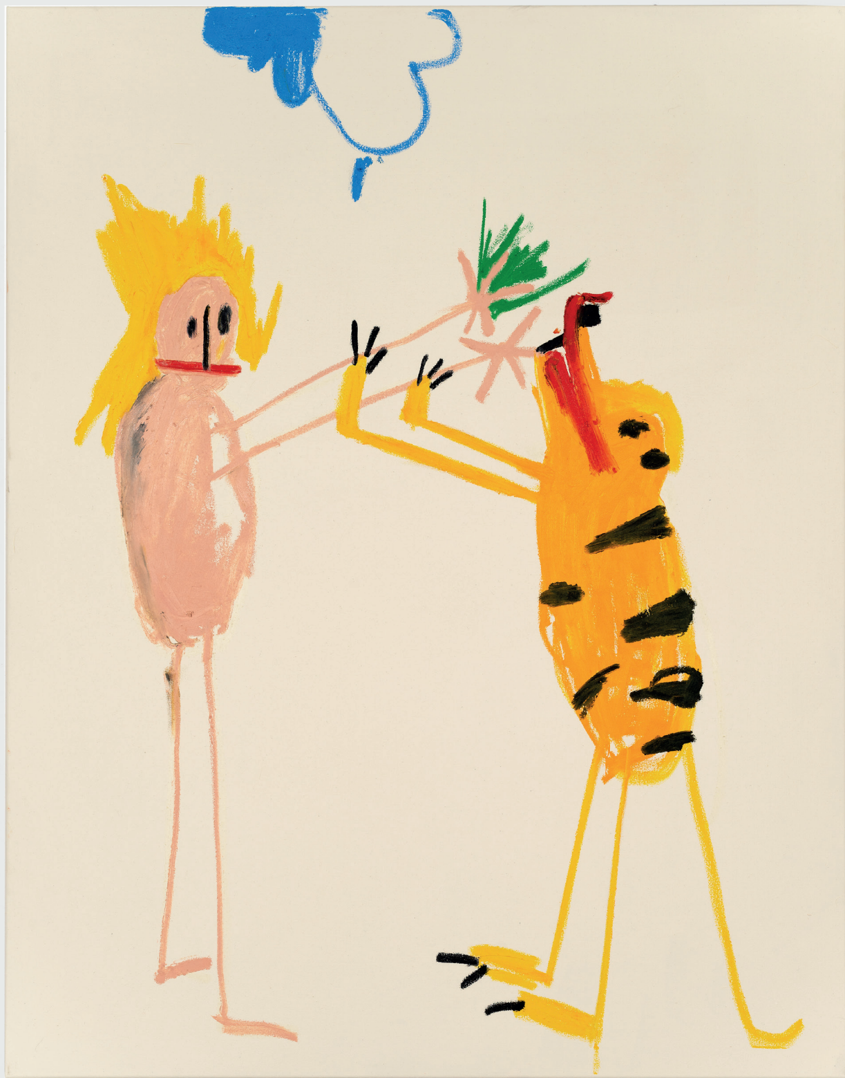
TIGER FUTTERN RUEO, 2019 Oilstick on canvas, 140 x 110 cm