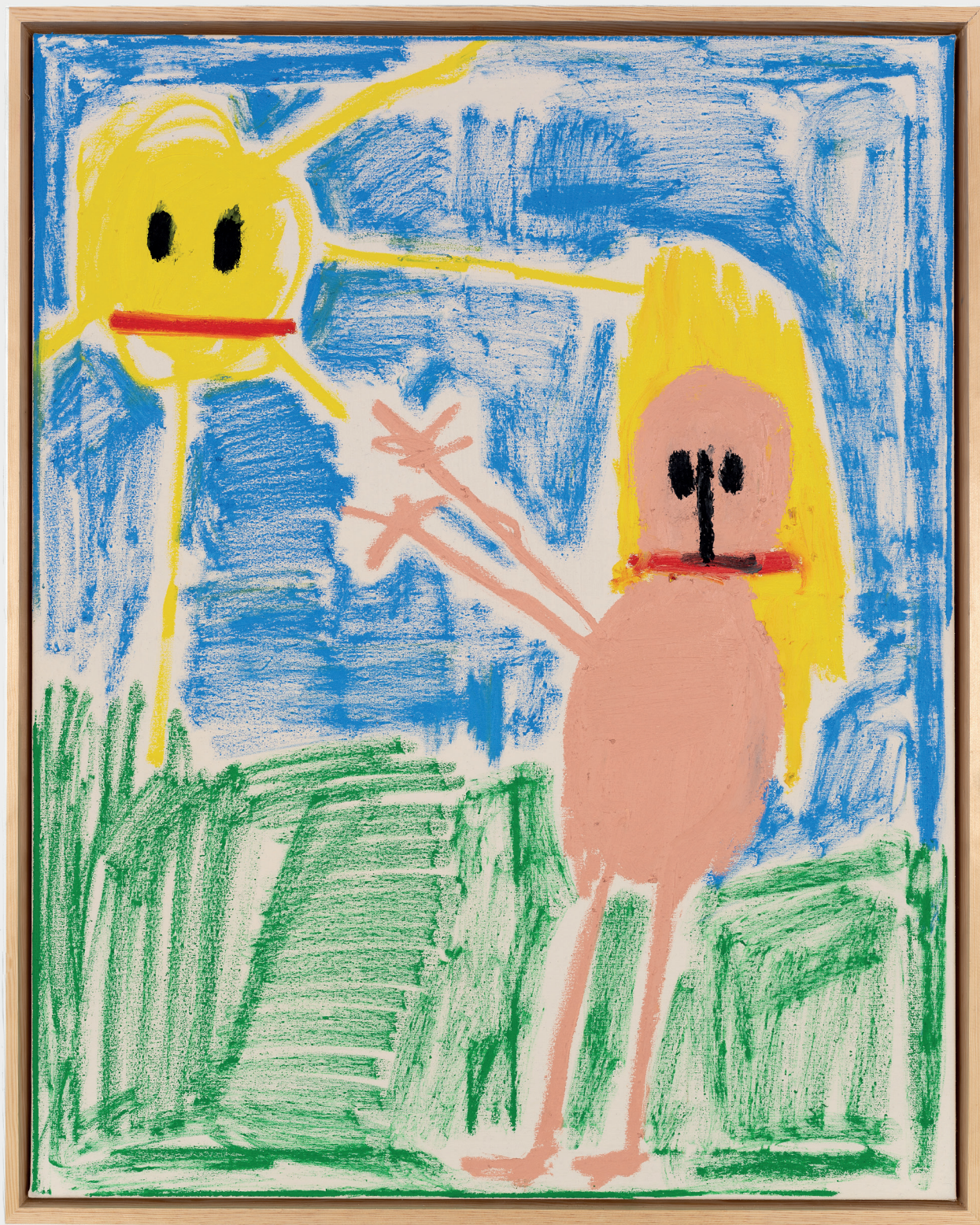
SONNENANBETTER, 2019 Oilstick on canvas, 100 x 80 cm