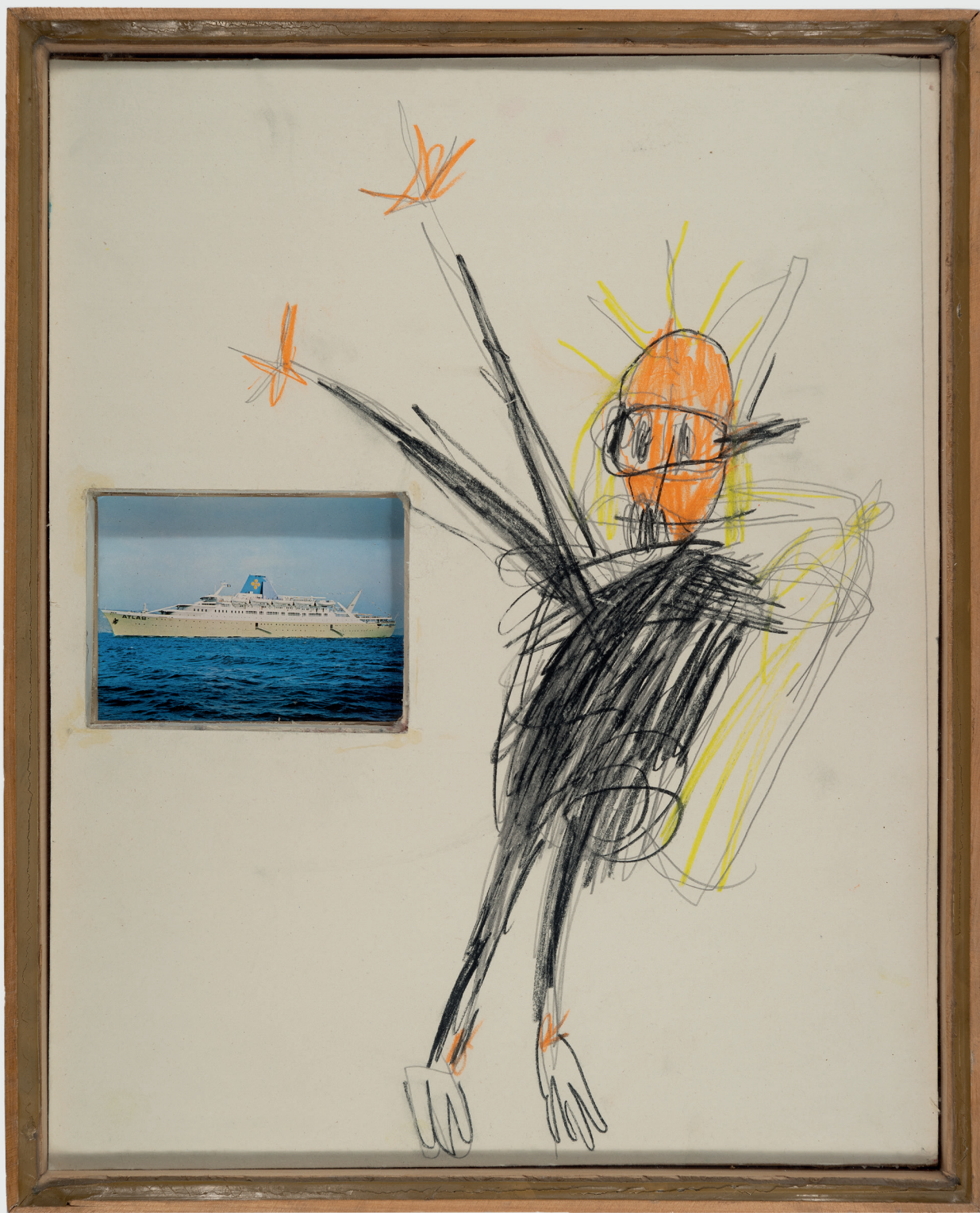
Tauchen Yeah K, 2018 Oilpastel on cardboard, postcard, 50,5 x 42 cm (framed)