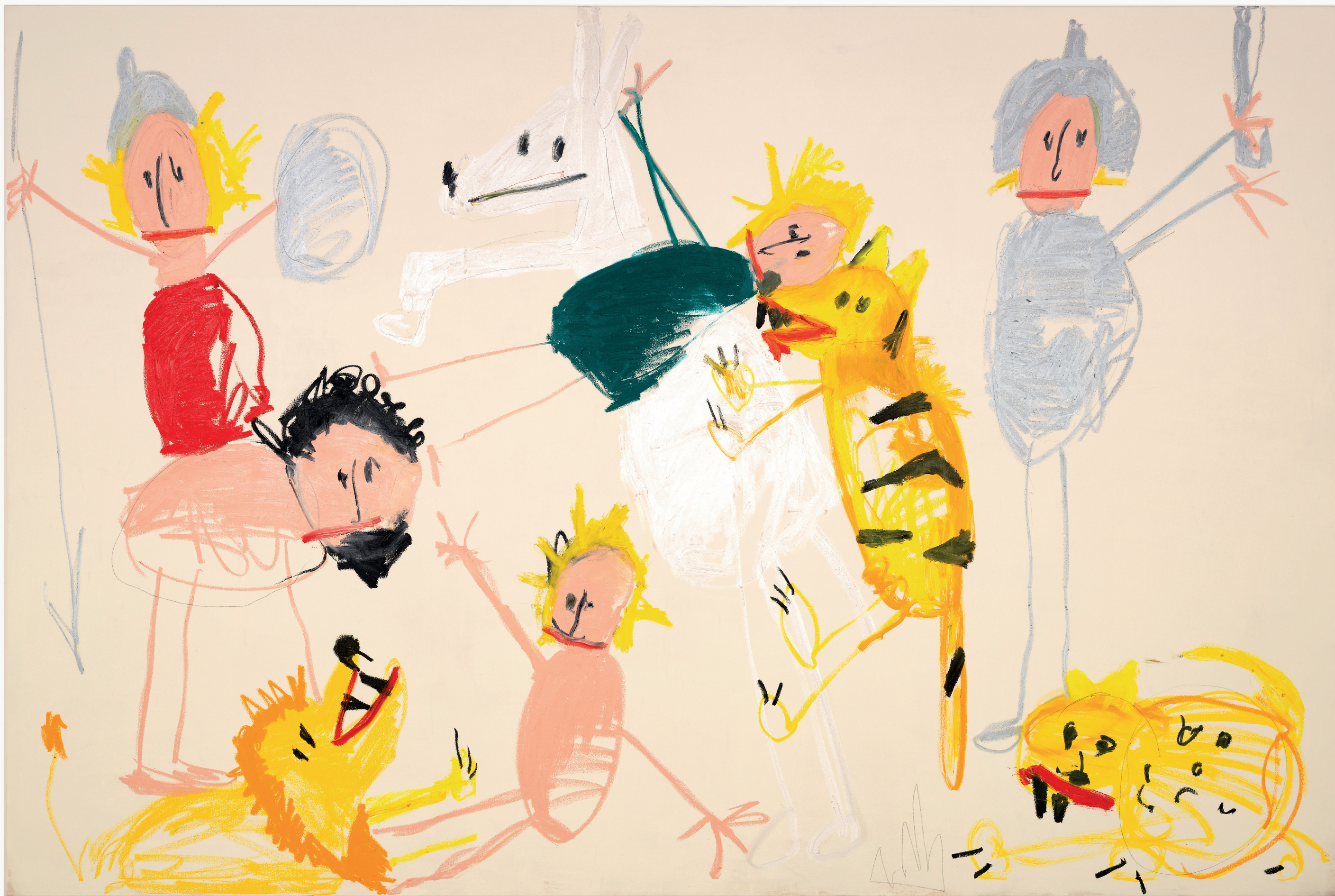
JAGD AUF ALLES, 2019 Oilstick & pencil on canvas, 200 x 300 cm