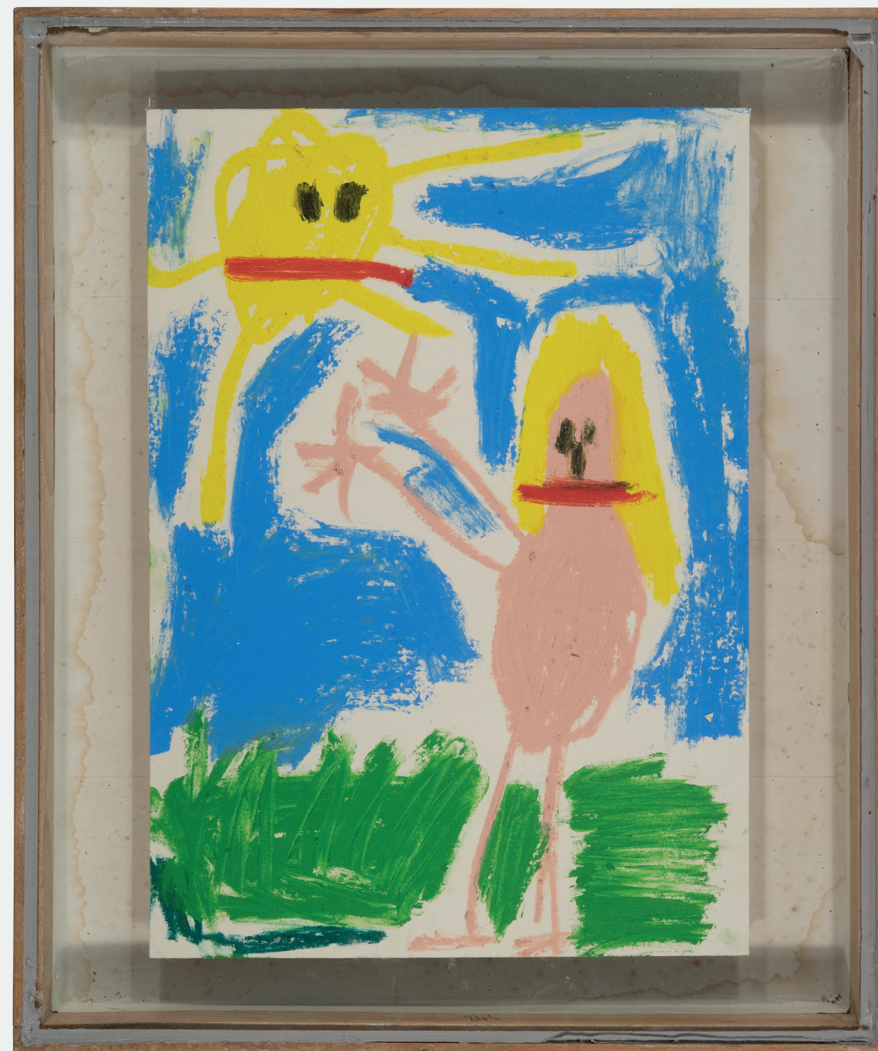
SONNENANBETTER K, 2019 Oilstick on cardboard, 50,5 x 42 cm (framed)