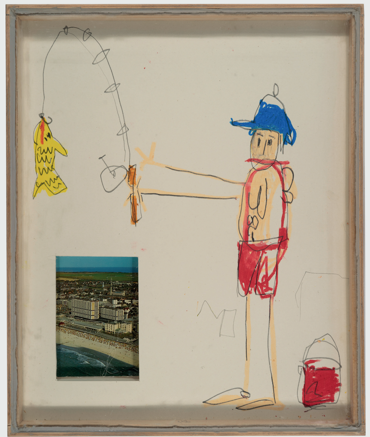
JIRGEN K, 2019 Oilpastel & pencil on cardboard, postcard, 50,5 x 42 cm (framed)