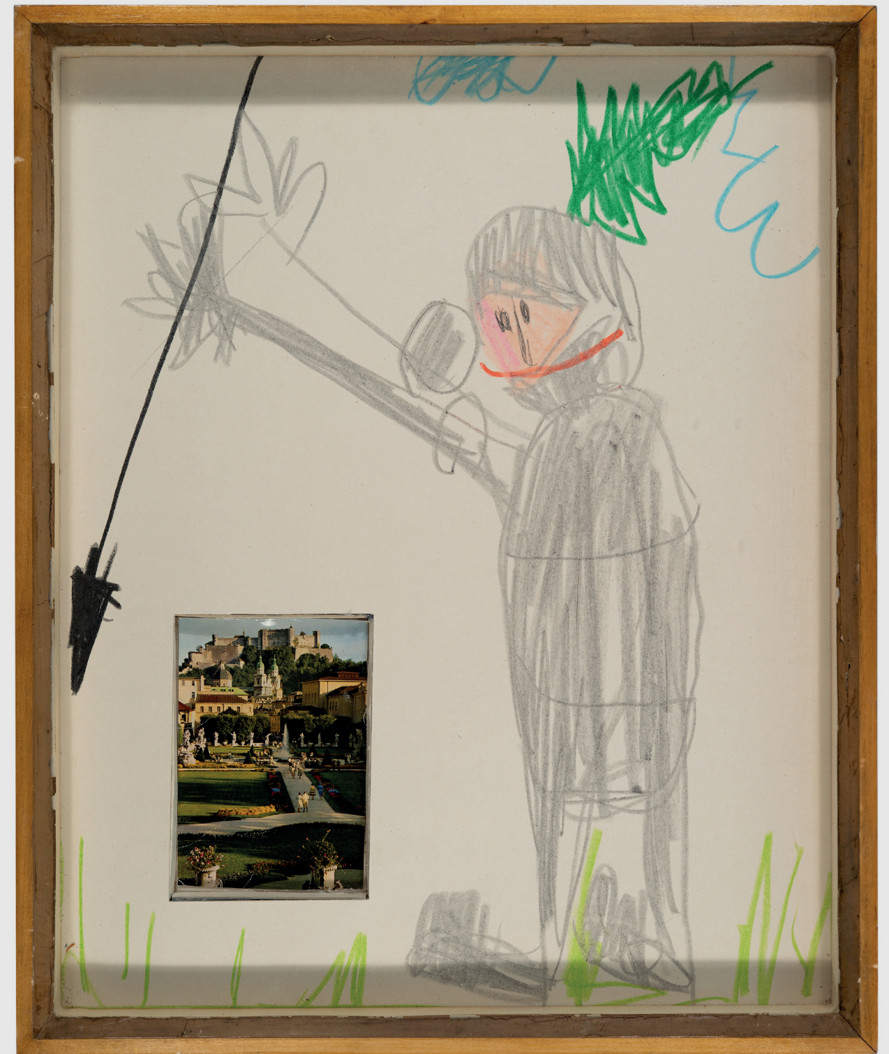
Ritter K, 2019 Oilpastel on cardboard, postcard, 50,5 x 42 cm (framed)