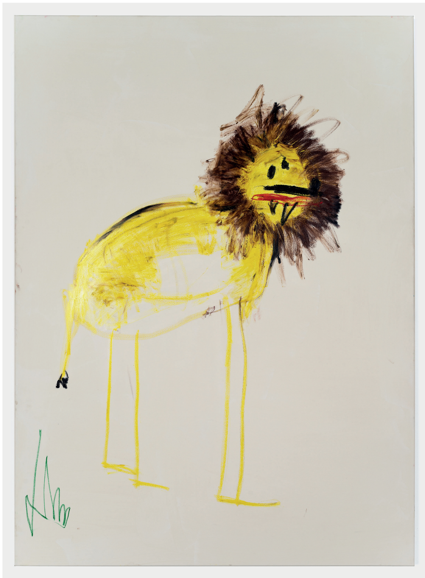
LÖBE groß, 2018 Oilpastel on canvas, 180 x 130 cm