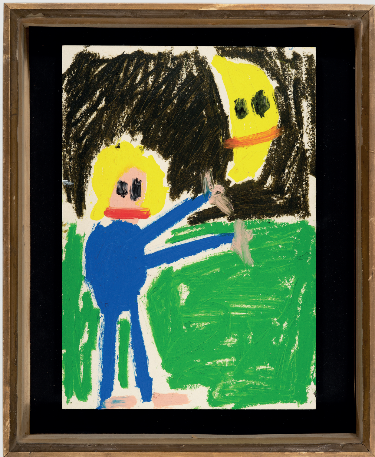
MONNDANBETTER K, 2019 Oilstick on cardboard, 50,5 x 42 cm (framed)