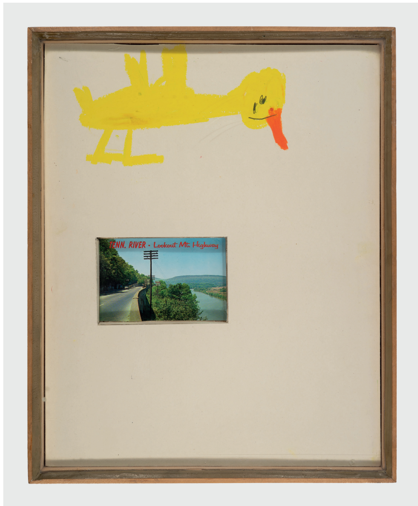
GANZ K, 2018 Oilpastel on cardboard, postcard, 50,5 x 42 cm (framed)