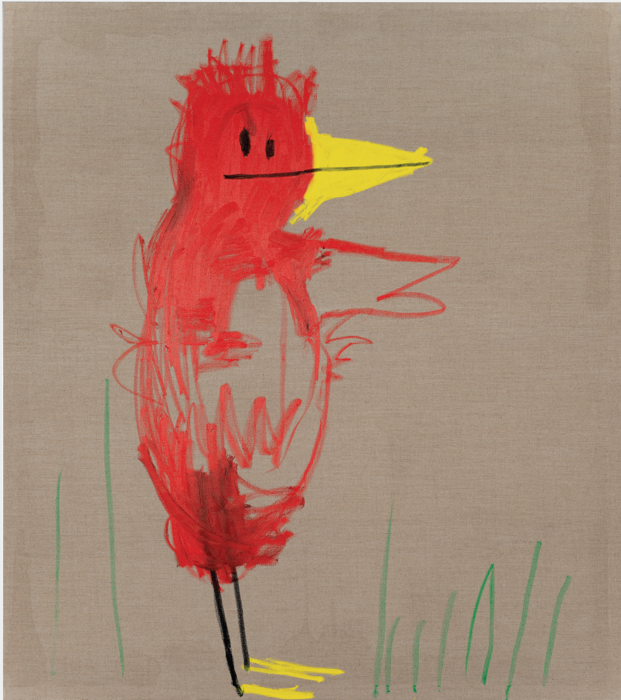
VOGI ROT, 2019 Oilstick on canvas, 180 x 160 cm