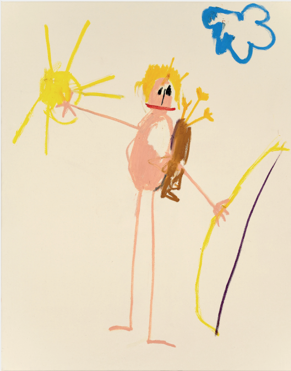
APULLO SONNENHAND, 2019 Oilstick on canvas, 140 x 110 cm