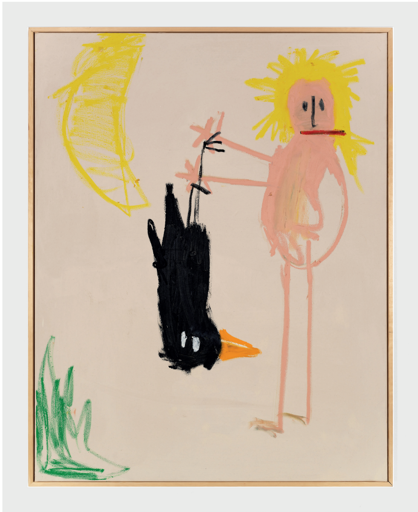
AMSEL UNTEN, 2019 Oilstick on canvas, 140 x 110 cm