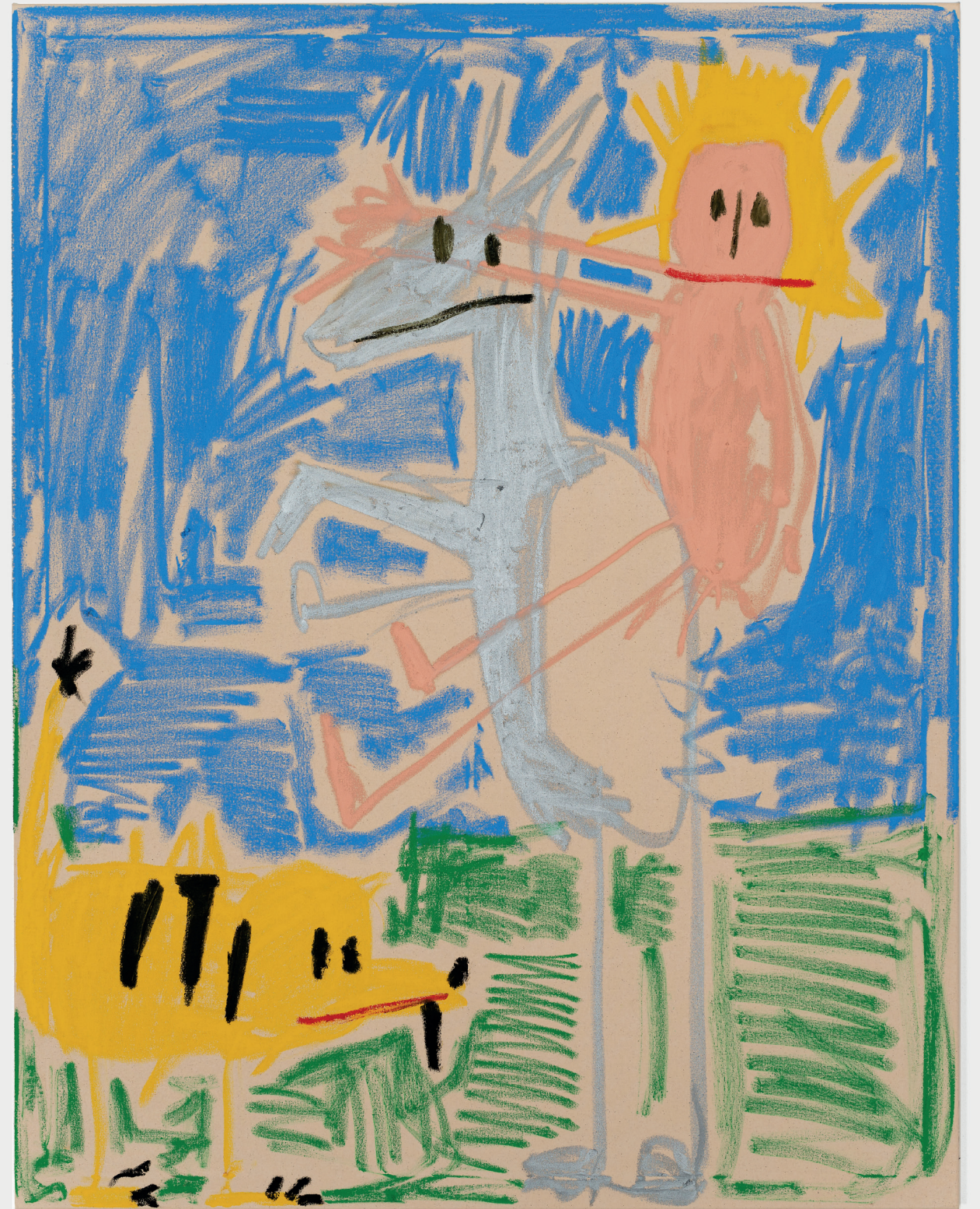
PFERD OBACHT TIGER, 2019 Oilstick on canvas, 140 x 110 cm