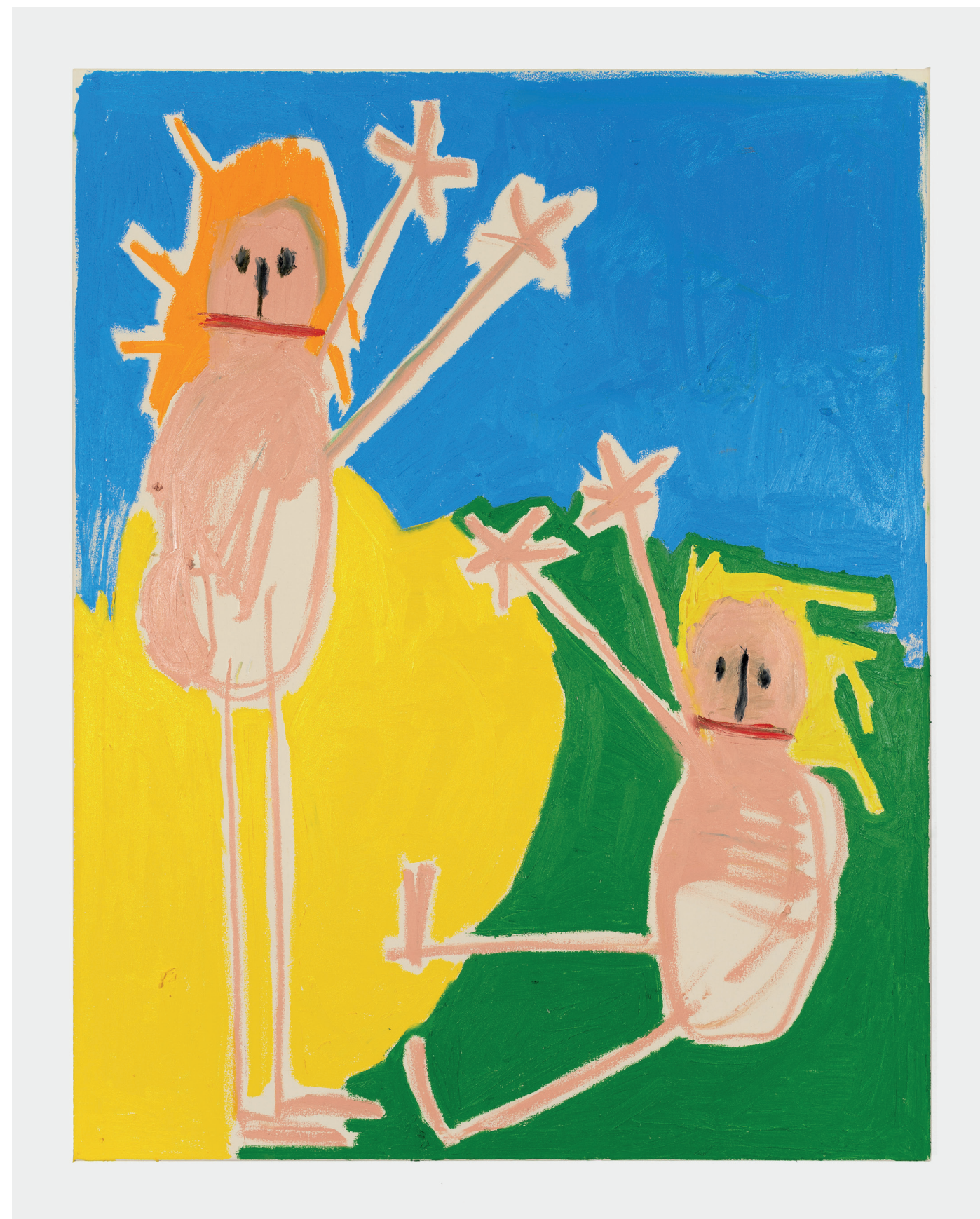
VOLLVOLL HIMMELBLAU, 2019 Oilstick on canvas, 140 x 110 cm