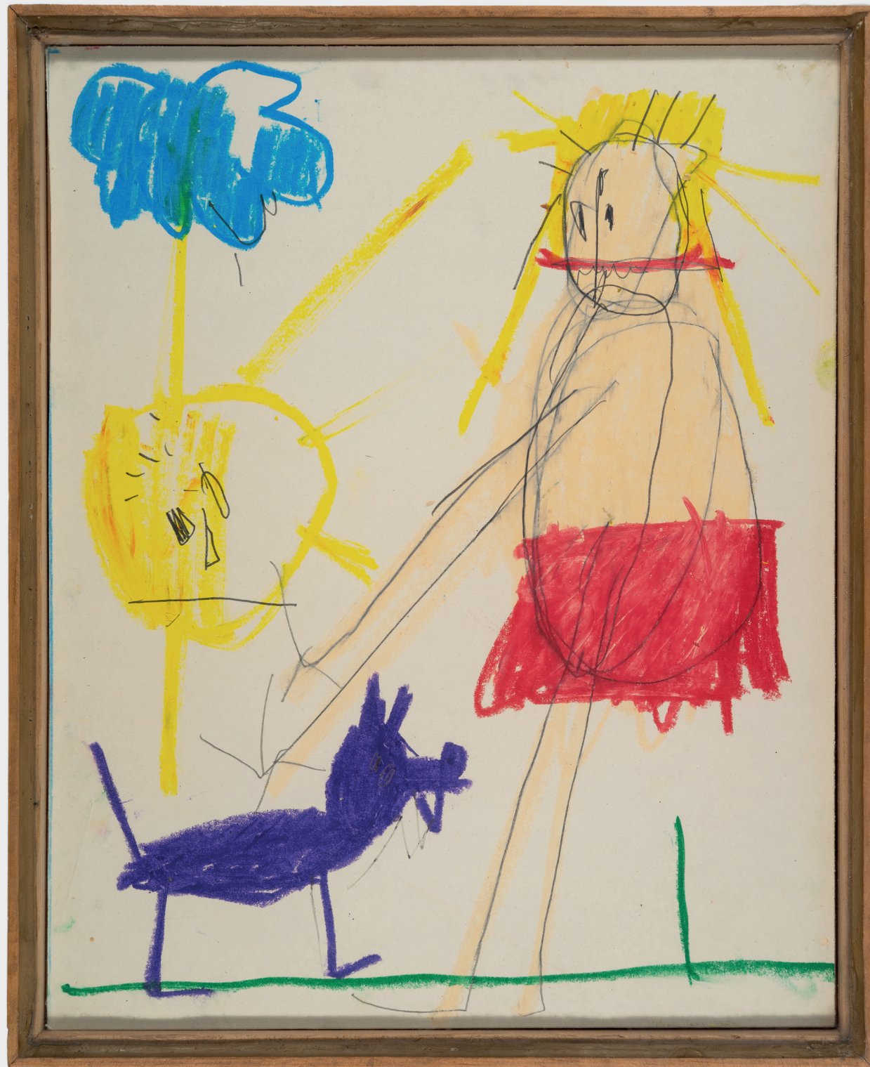
HUND Lila K, 2018 Oilpastel & pencil on cardboard, 50,5 x 42 cm (framed)