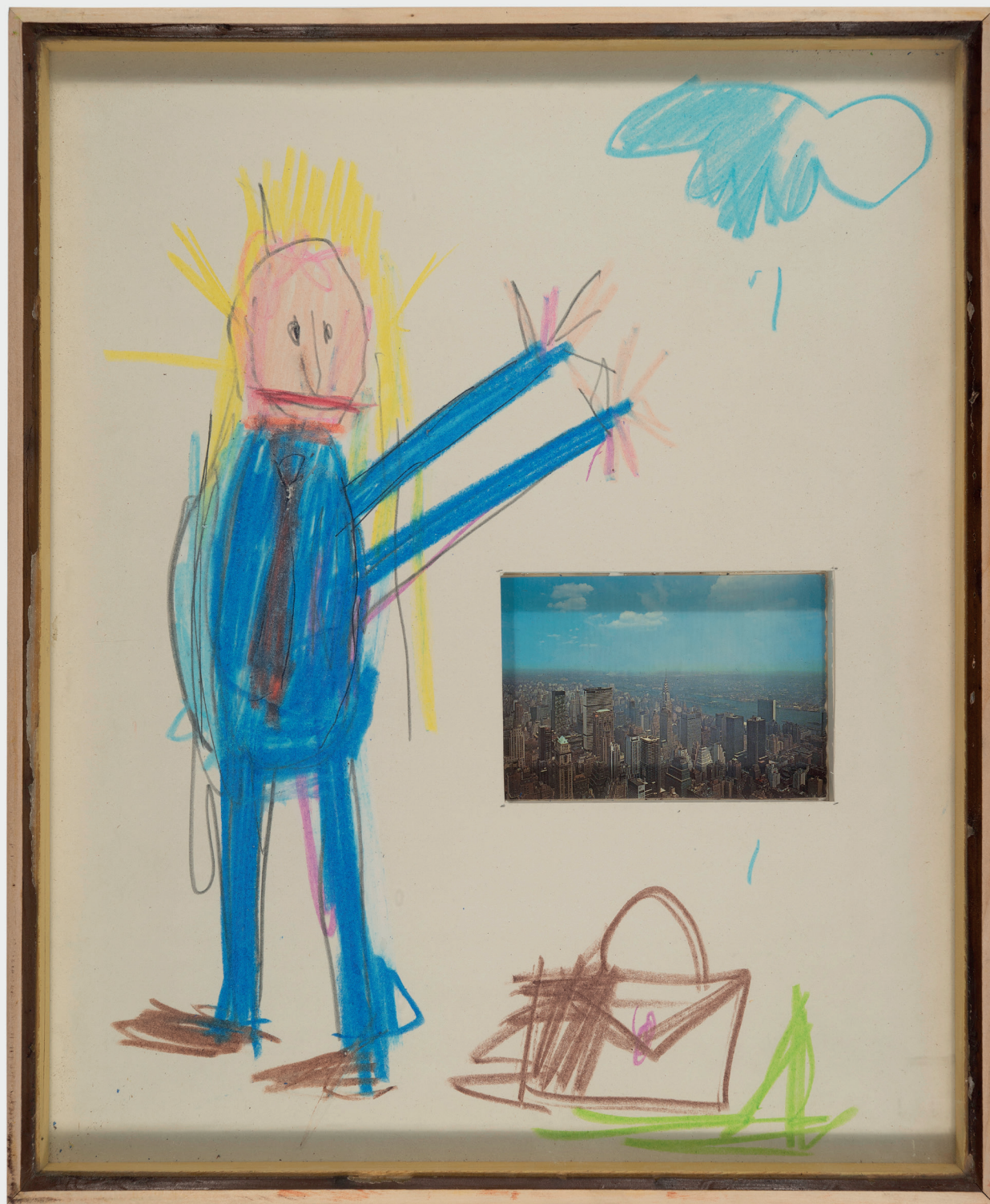
BISSNES YEAH K, 2019 Oilpastel & pencil on cardboard, postcard, 50,5 x 42 cm (framed)