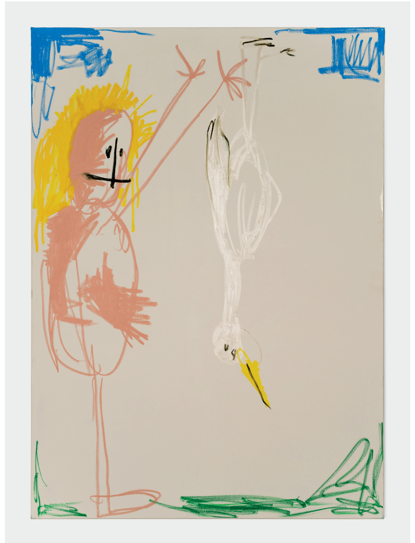
GANS UNTEN, 2018 Oilstick on canvas, 180 x 130 cm