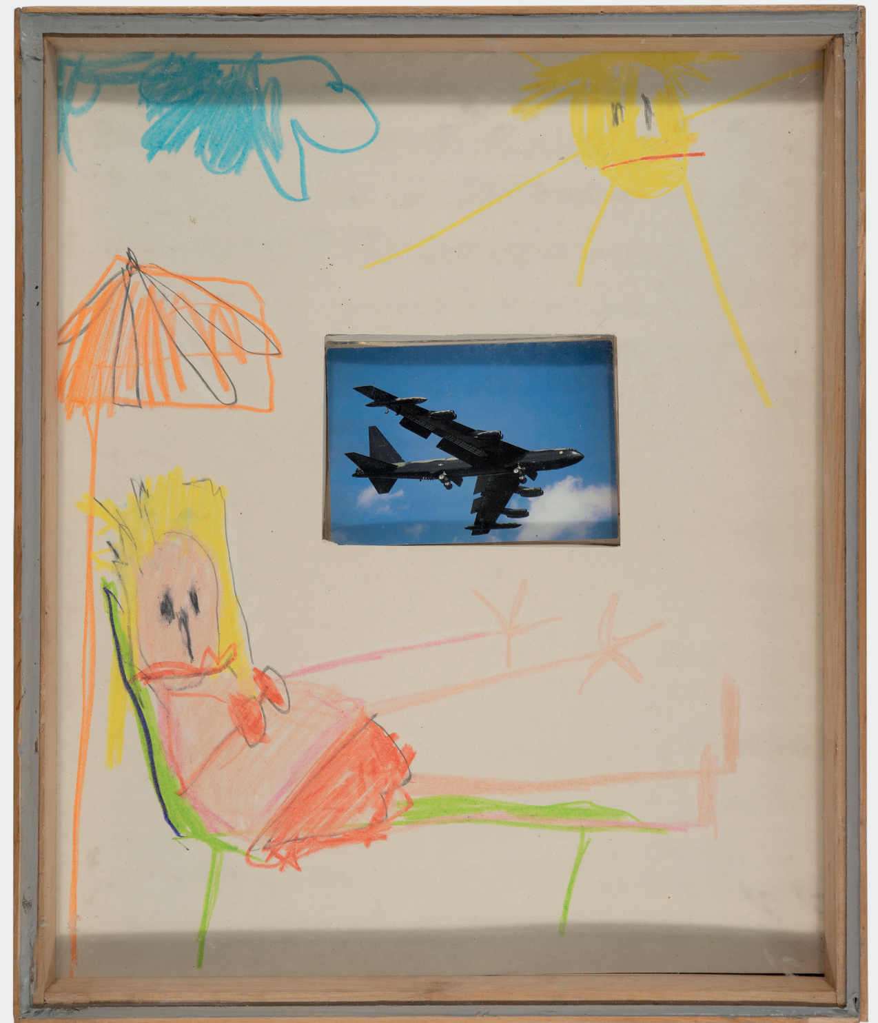
GABBI K, 2019 Oilpastel & pencil on cardboard, postcard, 50,5 x 42 cm (framed)