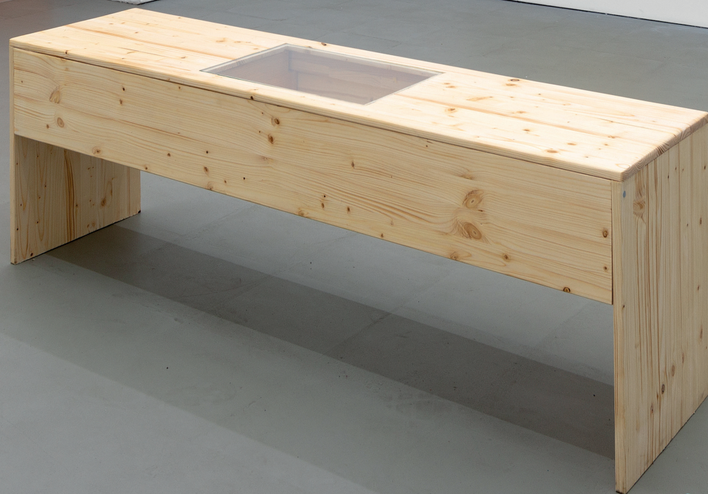
Installation view: ER DACHTE ALLES 2, Åplus, Berlin, 2019