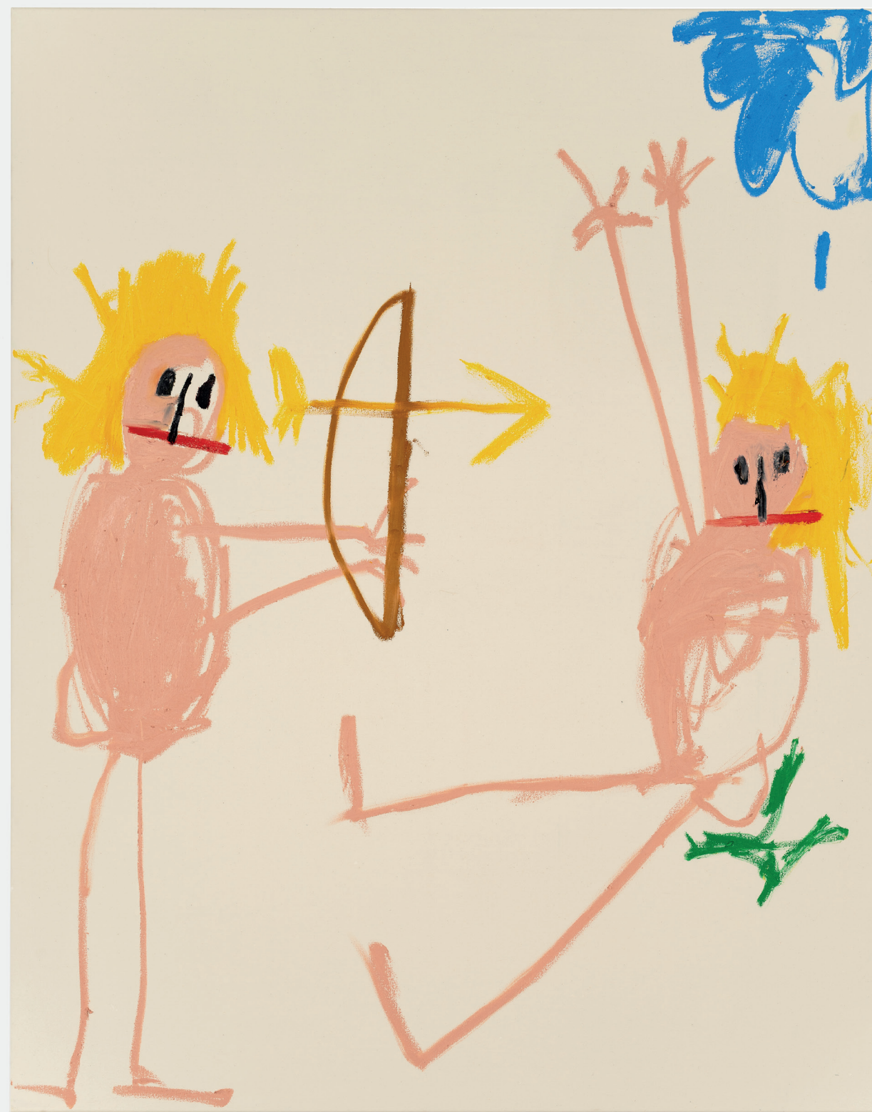
APULLO + DIDIANNA, 2019 Oilstick on canvas, 140 x 110 cm