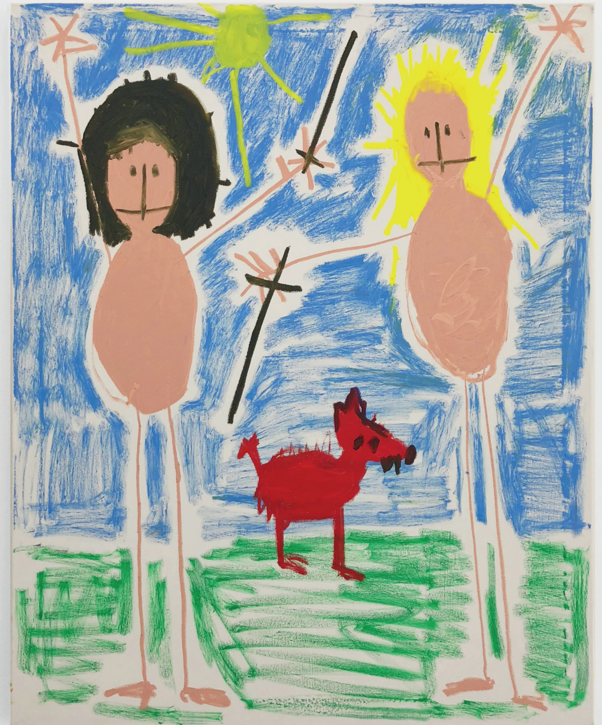
Zee KÄMPF, 2018 Oilstick on canvas, 100 x 80 cm